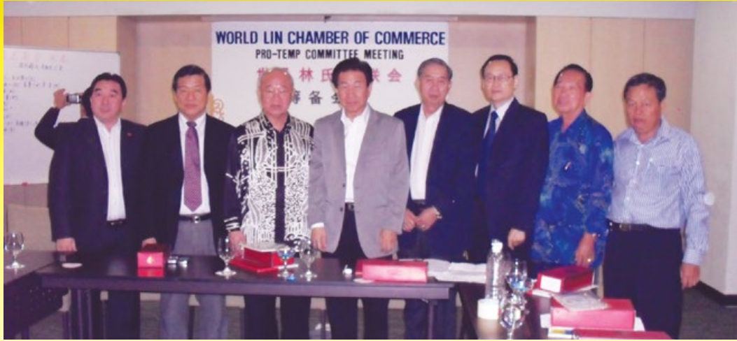
2nd Pro Tem Committees Singapore, July 2012 第二届新加坡筹备委员会